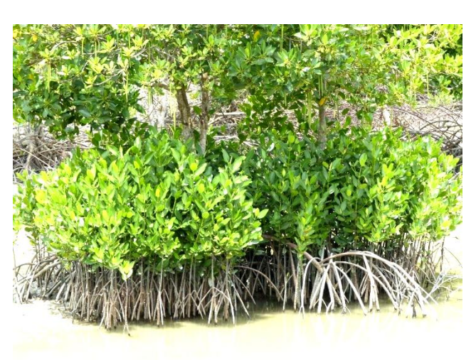
Young mangrove in Tanjung Rejo, Medan Mangroves in Tanjung Rejo, Medan

Once an inventory and stratification is completed, sampling design must take place. This was the next technical session on the first day, "Continuous and Permanent Monitoring and Sampling Design." The scope of forest carbon monitoring is to assess changes in carbon stocks over time. For estimating those it is equally important to assess carbon densities per unit of land, which requires sampling repeated over time, so Livelihoods proposes 3-5 year intervals, so in the case of these projects, a continuous sampling design is recommended. It is good practice to use permanent plots since these are more efficient in assessing changes in carbon stocks as opposed to temporary plots where changes over time might be due to changed plot location. The NGO teams needed to understand for their projects the necessary sampling size (number of measurement plots) for accurate measurement. Larger samples are more time-consuming and expensive to measure, but the variation among plots diminishes with an increasing sample size.