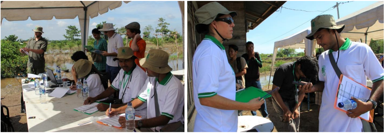
Field work preparation: How to find the plots, take the measurements and record the data.

On days 2 and 3, measurement exercises took place at the YAGASU project area outside of Medan in the village of Tanjung Rejo, where the teams performed transect, circle and square measurement activities on plots of Rhizophora spp. and Avicennia spp. The field work allowed the participants to practice a complete monitoring process in order to measure the carbon of one project (from mapping, locating plots, to stratification, sampling, measurement, and performing the calculations). According to Matthias SEEBAUER of UNIQUE, "...circular plots are less vulnerable to errors in the plot area than square plots since the perimeter (boundary of the plot) is smaller in relation to the area and thus the number of trees on the edge is less." How many plots needed was also part of the field work determinations by teams.