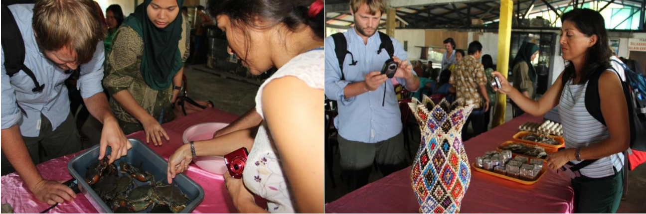
Mangrove forests provide habitats for these harvested soft shell crabs. The NGOs learned about products that generate income and livelihoods from the mangrove restoration efforts of YAGASU

Through the restoration of mangrove forests, community development and economic empowerment, YAGASU staff members and community members shared with the NGOs benefits of this work, which include: