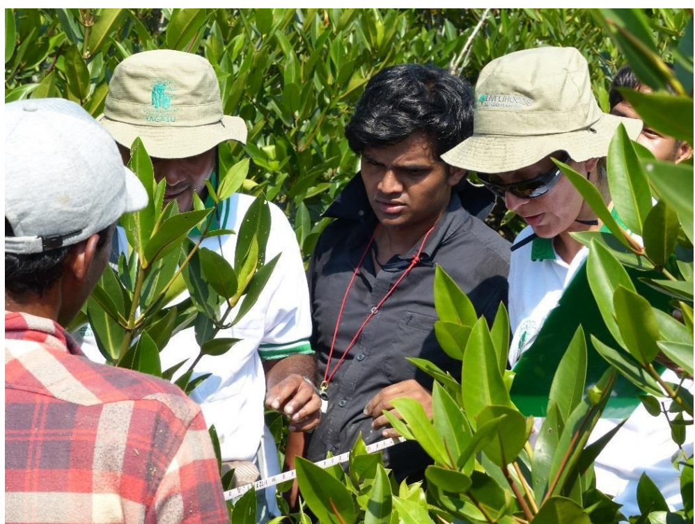
NGO participants measuring mangrove species after finding a plot

As the day progressed, the sessions covered the steps for measuring and monitoring carbon stocks, principles and good practice of carbon monitoring, VCS AFOLU methodology requirements and each NGO project implementer shared their current status in the overall monitoring process. Before accurate measurement for carbon monitoring can occur, an inventory must happen for each project. This training session detailed the steps to perform an inventory and stratification. An inventory refers to "the complete list of plots that were finally planted by the communities at the end of all campaigns." This inventory is a contract to state the exact boundaries and location of the project before the monitoring process can begin. An auditor hired by the Livelihoods Fund comes to check if plantations were effectively done in accordance with the contract, and determine if there are corrective measures needed. The inventory is established by the NGO and verified by an expert and all project stakeholders sign this inventory.