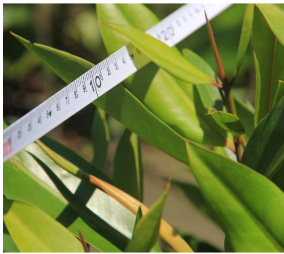
Measuring mangrove species in Tanjung Rejo, Medan